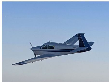
Correct 45-line position