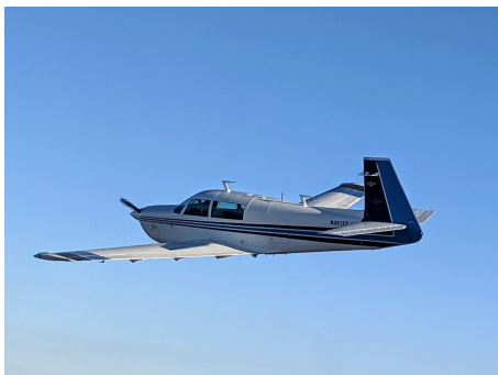
Acute (and low)